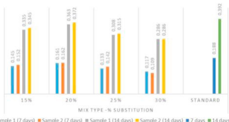
Fig. 1. Adhesive tensile strength (N) in mortars with rice husk ash.

This property's measurement allowed to establish that the rice husk ash in a partial replacement of cement with 20% obtained excellent results. A smaller difference is observed in the results concerning the standard sample established at 0.188 N and 0.392 N. In the results with corn husk ash, a decrease is identified for the rice's resistance values husk ash. The decrease is due to the different levels of silica in the rice husk. Both materials present a perfect opportunity to carry out partial cement replacements in type (C1) adhesive mixtures. The optimal replacement values range between 20% for rice husk ash and 15% for the case of corn husk. It is essential to highlight that the two materials exceed the reference standard after the test days (14 days) for the tensile adhesive strength.