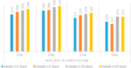
Fig. 3. Pozzolanic Activity Index in mortars with rice husk ash.

The pozzolanic activity index is defined as the ratio of tensile strengths of a mortar with pozzolanic material and that of a cement-based mortar only (standard). These indices were calculated for mortars with partial replacement by rice husk and corn husk ash. See Figures 3 and 4.