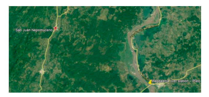
Fig. 2. Lotion of the Magdalena River - Plato station and the intake location

Reliable records from the water level monitoring station are essential to determine the variability of the water level of the Magdalena River and consequently for the pipeline runway design.